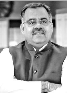
■ TARUN CHUGH

Punjab, the sword and the broad basket of India has given many politicians and leaders including a Prime Minister and President to India. Whereas the reign of the President, Giani Zail Singh saw the infamous attack on the Golden Temple under the regime of the Congress-Government in 1984; the reign of Manmohan Singh who served the office of Prime Minister two times did not see any special favour to Punjab though he being a hardcore Punjabi. His tenure was tenure of Centre-Punjab tiff, tensions and conflict. However, since 2014 a visible change can be seen towards Punjab and Punjabis-be it in the policies of the Centre or the personal touch for the sentiments of Punjabis or healing the long term pains and issues of Punjabis.