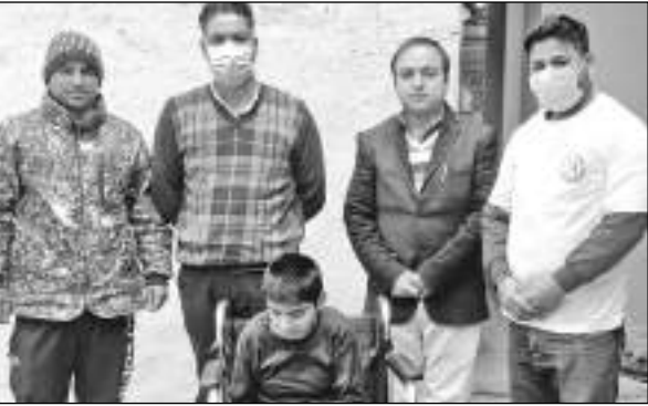
Admn officials providing wheelchair to a specially-abled child.

The new BMW X3 emphasis on classic X-elements as standard. It has a more modern look with a more powerful presence, plenty of space and driving dynamics. SportX Plus variant ensures a greater focus on sportiness and "X-ness". The M Sport variant is enriched with high-quality X elements. BMW India Financial Services offers an attractive BMW 360? financial plan with 'drive away monthly price' of Rs 79,999, assured buyback of up to 60% and flexible end of term options. Customized financial solutions can be further designed as per individual requirements.