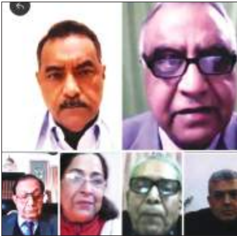
Dignitaries interacting online during a programme.