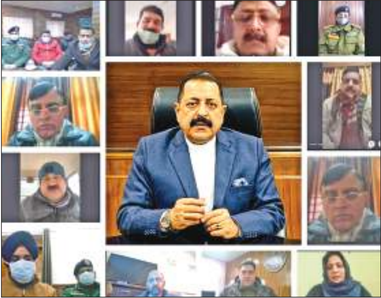
Union Minister Dr Jitendra Singh holding a virtual meeting with DDC Chairpersons, Deputy Commissioners and SSPs of six districts falling in Udhampur-Kathua-Doda Lok Sabha Constituency, on Sunday.

that there is no room for complacency and all COVID norms and protocols must be followed in the strictest possible manner. He also lauded the efforts of DCs for completing the vaccination process in his Parliamentary Constituency, barring a few far-flung pockets in districts like Kishtwar.