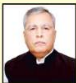
Advisor to Hon'ble Lieutenant Governor, J&K