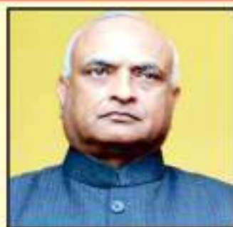
Lt. Governor राज्यपाल Union Territory of Ladakh केन्द्रीय शासित प्रदेश लद्दाख

The National Voters' Day is celebrated every year to mark the foundation day of the Election Commission of India, which was established on 25th January, 1950. On this day, the entire nation reverberates with the festivities of democracy as crores of Indians celebrate their right to vote. The purpose of celebrating this day is to increase enrolment of voters, especially young voters. The day is also utilized to spread awareness among voters regarding effective participation in the electoral process.