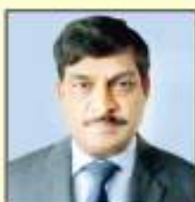
Chief Secretary Jammu & Kashmir