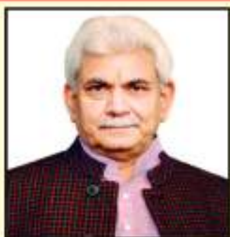
Raj Bhavan Jammu-180001

I would like to congratulate the citizens of the Union Territory of Jammu & Kashmir on the occasion of 12th National Voters' Day. National Voters' Day is observed annually on 25th January across the country. The central theme of this year's celebration is "Making Elections Inclusive, Accessible and Participative" .