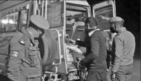
A team carrying out checking at Nowshera.