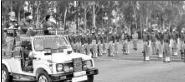
DC Indu Kanwal Chib inspecting the parade at Udhampur.

POONCH: The Full Dress Rehearsal for the 73rd Republic Day celebration was held amid tight security and due adherence to all COVID Protocols here at sports