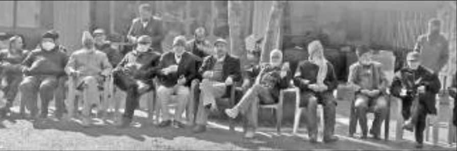
Members of Bar Association during the meeting at Poonch.