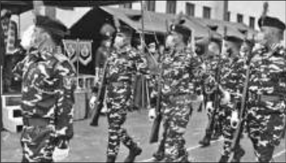
A contingent giving salute during march past at Doda.