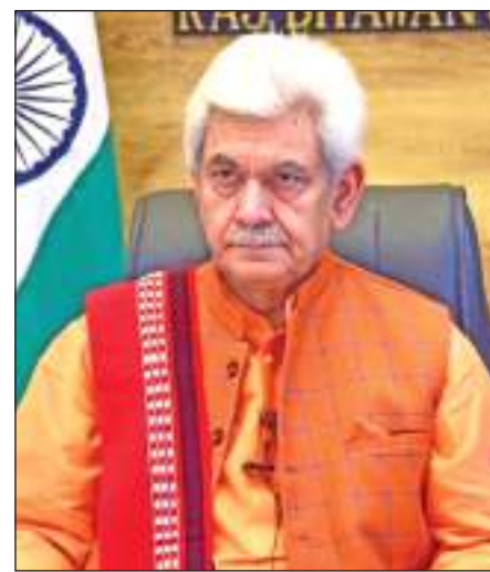
LG Manoj Sinha extending greetings to people on the eve of 73rd Republic Day.

Lt Governor said that the Republic Day is the day of introspection, an occasion when every citizen has to remind himself of his duty to protect and further nourish the ideals and