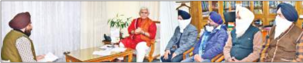
DGPC Jammu members interacting with Lt Governor, Manoj Sinha.