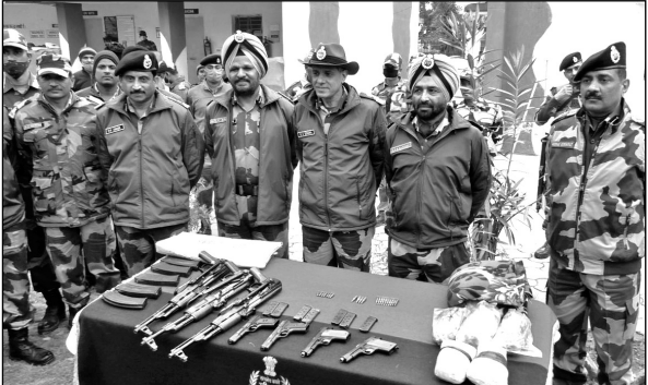
Arms, ammunition and drugs recovered by BSF troops along IB in Arnia sector.

The alertness of troops deployed on the border led to the seizure amid heightened terrorist activity on the Pakistani side, Boora said, adding that Pakistan continues