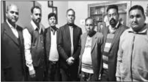
Sabha members during the meeting at R S Pura.

■ STATE TIMES NEWS R.S.PURA: The J&K Batwal Sabha members paid tributes to the people who lost their lives on new year's eve in Mata Vaishno Devi Bhawan. Members while expressing grief over the loss of lives in the stampede said it was an unfortunate incident that took place on the beginning of new year. They extended their condolences to the bereaved families and prayed to Almighty to grant eternal peace to the departed