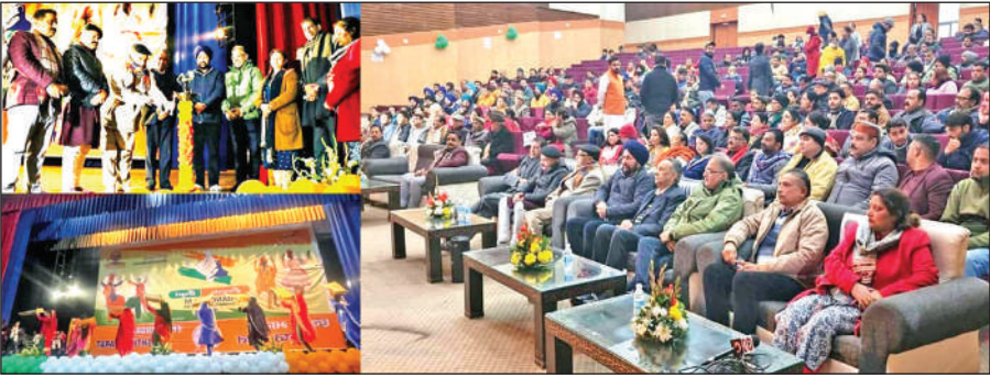
BJP leaders amd others attending event 'Dogri and Punjabi Samagam' at Shikshak Bhawan.

that the cultural bonds can be strengthened by first cultivating the same by creating healthy environment at the grass roots level i.e. by reaching out to the people there and making them aware about the significance of blending of cultures and the role of BJP in promoting it. He urged party leaders present on the occasion to take the policies and programmes of Bharatiya Janata Party (BJP) to every nook and corner across the J&K Union Territory. He directed them to bring into motion the entire party cadre especially the activists and workers to make the people aware about the party's achievements after it