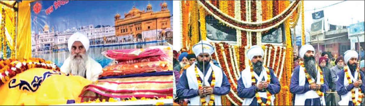
Nagar- Kirtan taking out by Sikh community members from Simbal Camp to Indira Nagar, Jammu.