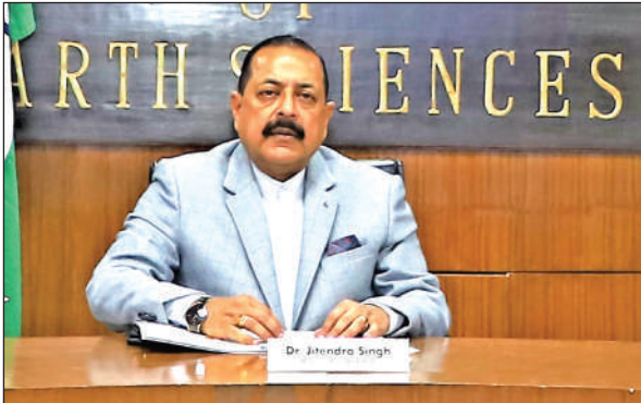
Union Minister Dr Jitendra Singh sharing details about Deep Sea Mission, at New Delhi.

The mission, said the Minister, heralds India's ushering into an era of "Blue