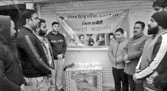
Tributes being paid to martyrs of Dangri terror attack.