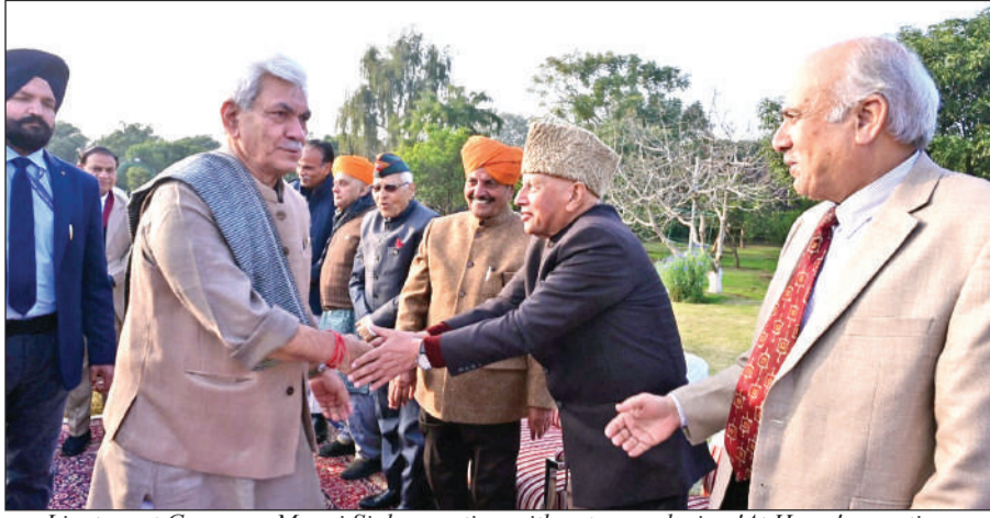
Lieutenant Governor Manoj Sinha meeting with veterans during 'At Home' reception.

Family members of the martyrs of Jammu Kashmir Police, Security Forces, ex-servicemen and the changemakers of Jammu Kashmir were among the special invitees.