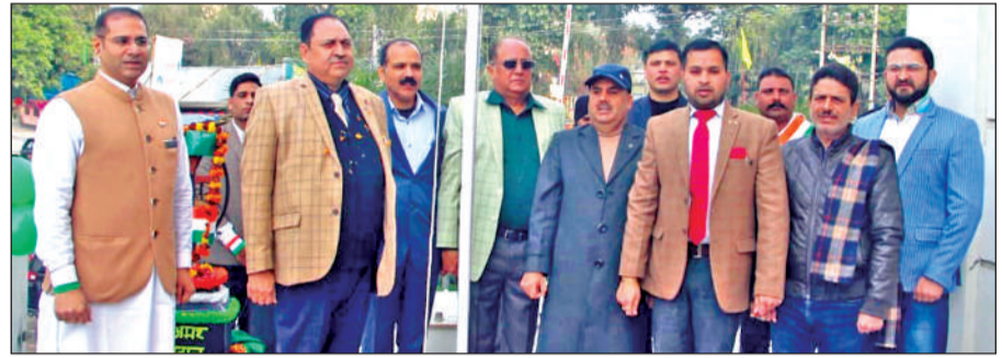
Jammu Newspapers Editors Guild members unfurling the National Flag during 74th Republic Day celebration at Hotel Lemon Tree Jammu.