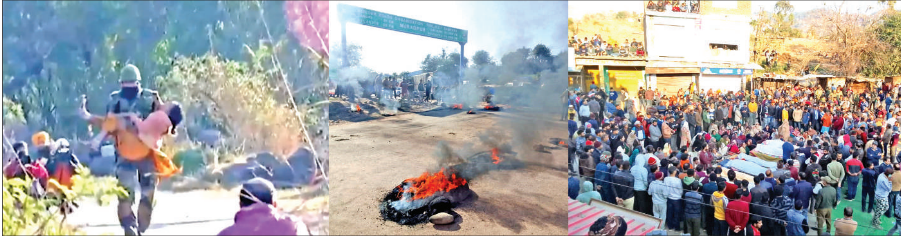
Blast victims being rescued in Dangri village after the IED explosion while locals staged protests on Monday as Rajouri observes Bandh to condemn brutal attack.