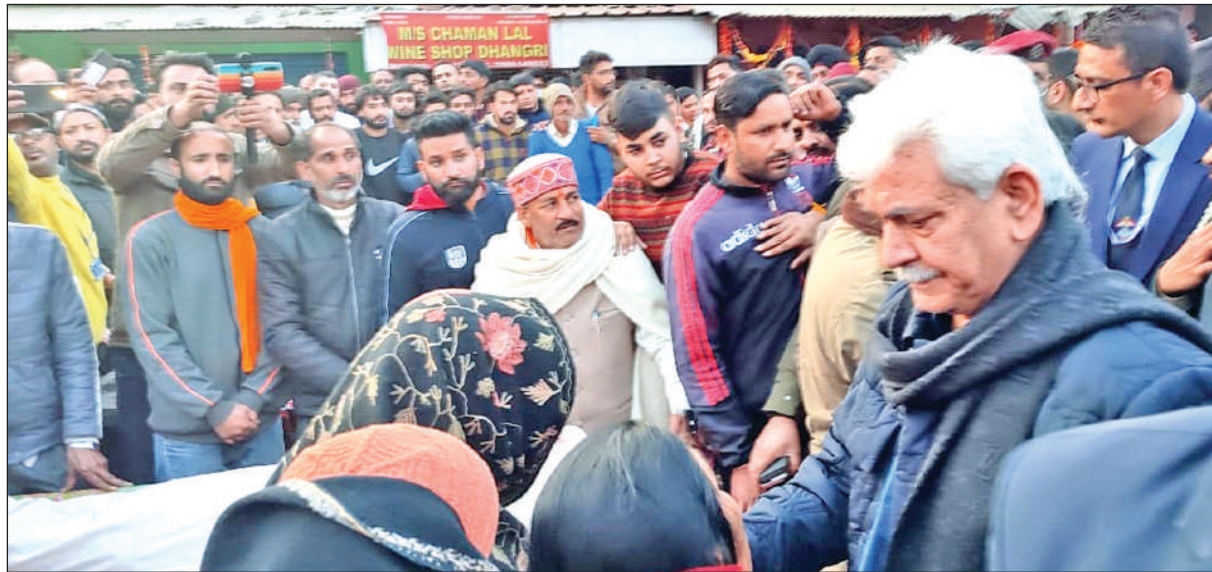
LG Manoj Sinha meeting with the family members of martyrs at Dangri village. (More pics on page-9)

I have heard several people among you. It is a commitment of the government of India to stamp out terrorism from Jammu and Kashmir," the LG told the protesters. He was accompanied by