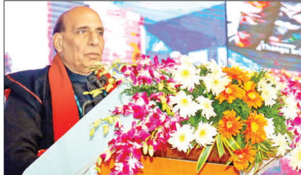
Defence Minister Rajnath Singh addressing after dedicating 28 infrastructure projects to nation.

"India is a country which never encourages war and always wants to maintain cordial relations with its neighbours.. This is our philosophy inherited from Lord Rama and from the teachings of Lord Buddha. The country has every capability to face any kind of situation