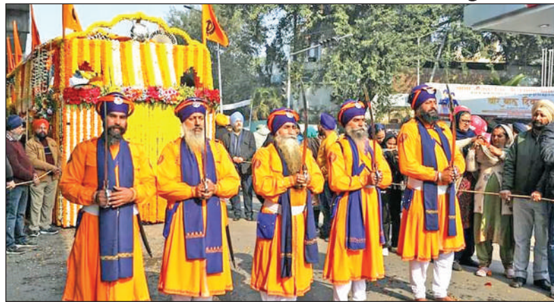
Panj Pyare leading the Nagar Kirtan in Jammu on Tuesday.