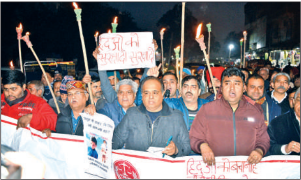
Traders taking out candle march to pay tributes to Rajouri terror attack victims.