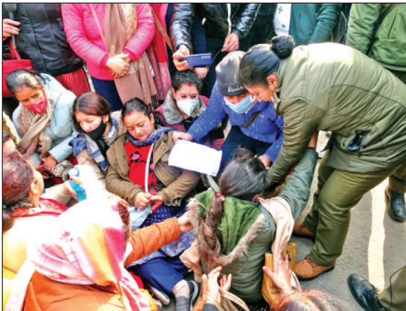
Agitating ReK teachers during a protest in Jammu on Wednesday.

Hundreds of Rehbar-e-Khel teachers continued their protest for the sixteenth consecutive day on Wednesday under the banner of Jammu and Kashmir Rehbar-e-Khel Teachers Association and appealed to the Jammu and Kashmir administration to fulfil the promises made to them.