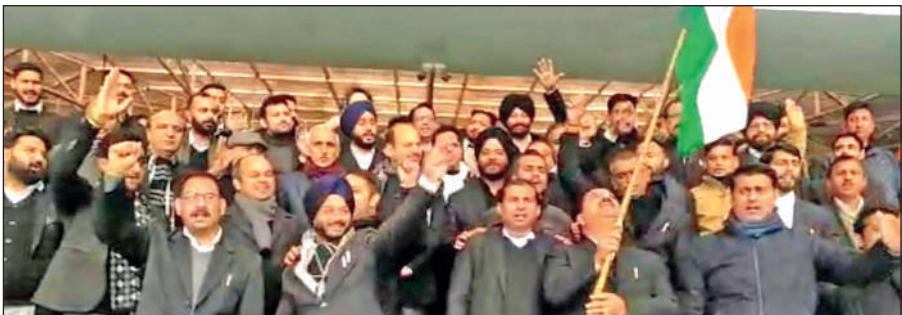
Lawyers staging protest against Rajouri terrorist attack in Jammu.

The JKHCBAJ suspended work in all the courts, tribunals, commissions, revenue courts on Wednesday against the killings which has shaken every civilized citizen of the society in the Union Territory of Jammu and Kashmir. The JKHCBAJ is of the opinion that if such inci-