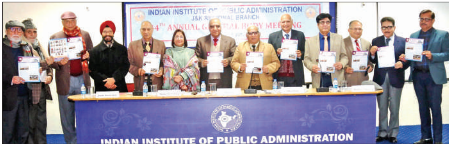
Dignitaries releasing brochure during 44th Annual General Meeting of J&K IIPA.