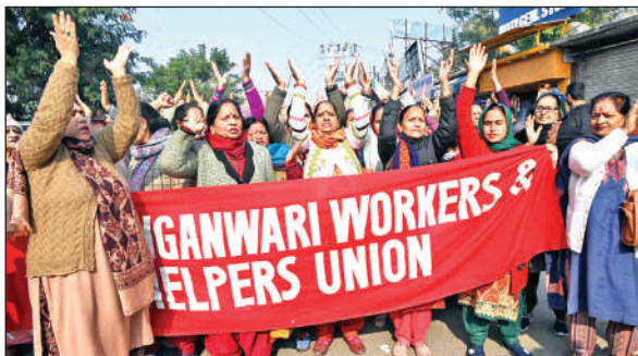
Anganwari Workers and Helpers raising slogans during a protest at Jammu.

They were strongly opposing the proposal of Comprehensive Human Resource (HR) Policy to govern the engagement, leaves, promotions, and other important aspects of