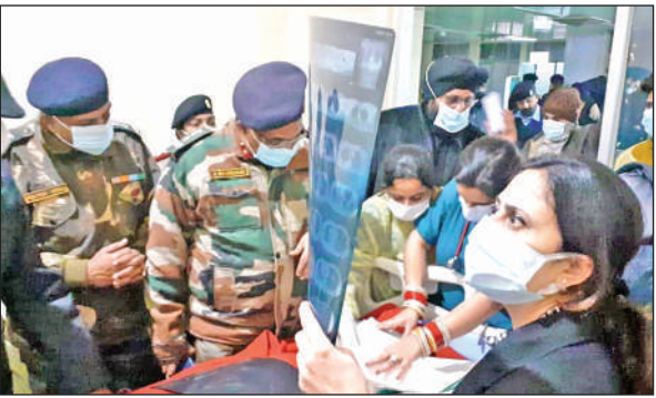
Experts' team examining treatment procedure at GMC Jammu on late Thursday evening.

Pertinent to mention that earlier in morning, the atten-