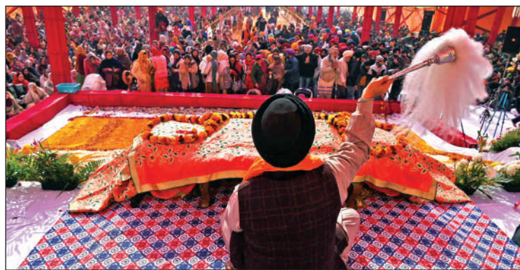
Gurpurab celebrations: Devotees paying obeisance at Gurudwara Guru Nanak Dev Ji Chand Nagar Jammu on Thursday.

The religious preachers, including Ragis, who came from different parts of the UT and outside, delivered religious sermons and teachings of Guru