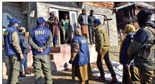
SIU team carrying out search in a house at Kupwara district.