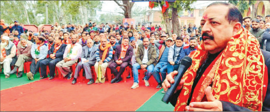
Union Minister Dr Jitendra Singh addressing a public meeting at Billawar, on Saturday.

At that time also, said the Minister, though we were in opposition in J&K, we had strongly demanded a separate hill district for Billawar-Basohli but the Reorganisation Committee constituted by the then government did not pay any heed and instead, decided to have ten districts each for each of the two divisions of Kashmir and Jammu. This was done