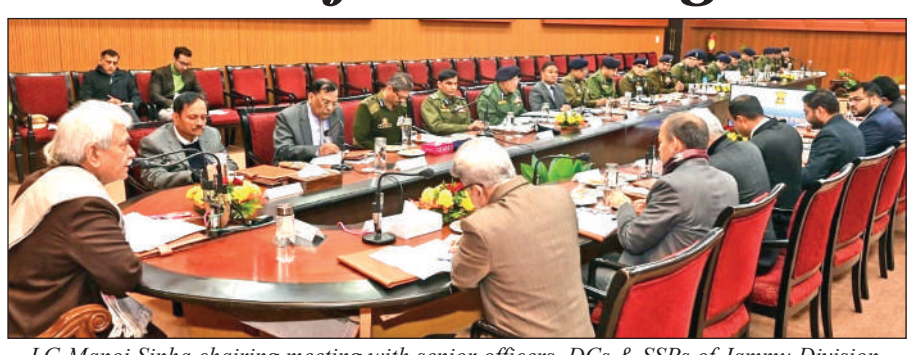
LG Manoj Sinha chairing meeting with senior officers, DCs & SSPs of Jammu Division.

■ STATE TIMES NEWS JAMMU: Lieutenant Governor Manoj Sinha on Thursday directed the District Administrations in the Jammu Division to ensure saturation of schemes in all border villages and to connect youth of all Panchayats to self-employment and entrepreneurship opportunities. Chairing a meeting with the senior officers, Deputy Commissioners, SSPs and discussed various issues concerning development and security in Jammu Division, the Lt Governor also instructed the officials to prepare regular outcome reports of Block Divas,