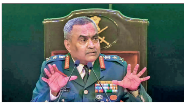
Army Chief Gen Manoj Pande addressing media at New Delhi.

■ STATE TIMES NEWS NEW DELHI: The situation in Jammu and Kashmir's Rajouri-Poonch region is a matter of "concern" and enhancing deployment of troops, boosting intelligence apparatus and reaching out to local people are part of measures being initiated to contain terrorist activities in the area, Chief of Army Staff Gen Manoj Pande said on Thursday. At a press conference, he also said he has conveyed an unambiguous message to the soldiers and commanders that there will be "zero tolerance" to human rights violations and they must operate in a professional manner. Three civilians were killed