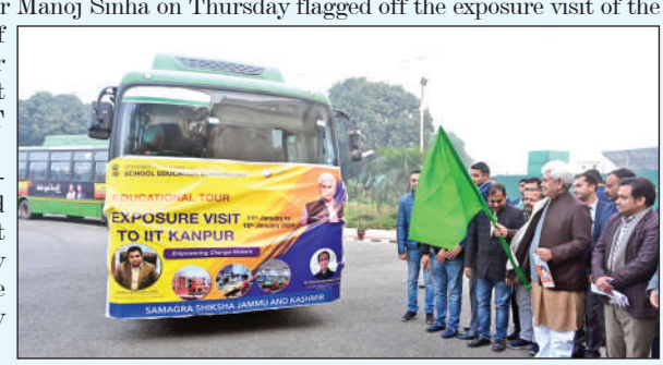
LG Manoj Sinha flagging off exposure visit of J&K students.