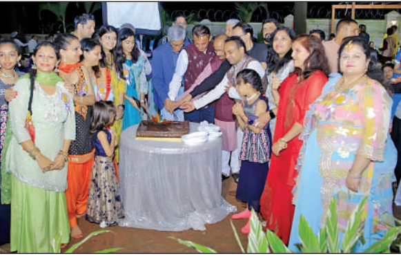
Jammu Dogra Association Uganda members during Lohri celebration at Kampala.