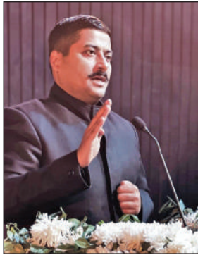
Kashmir Union Territory.