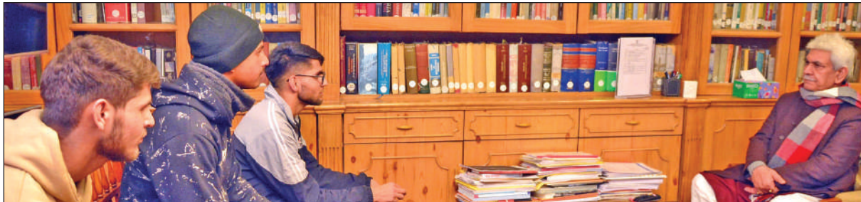
Delegation of Athletes from Kashmir calling on Lieutenant Governor Manoj Sinha on Tuesday.