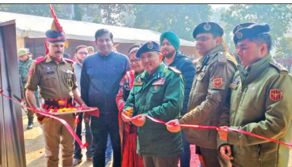
ADGP Jammu Zone Anand Jain inaugurating medical camp at DPL Jammu.