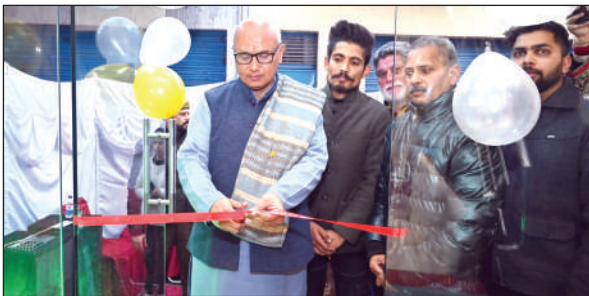
Former Mayor Rajinder Sharma inaugurating outlet.

The former Mayor said that task has been accomplished in line with the vision