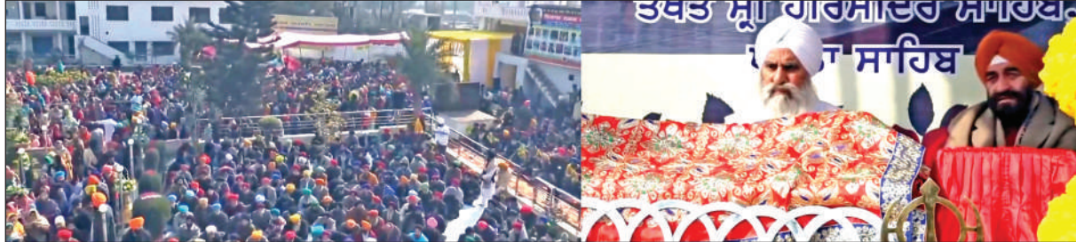
Sikh devotees visiting Gurdwara Digiana Ashram Jammu on 358th Parkash of Guru Shri Gobind Singh Ji.