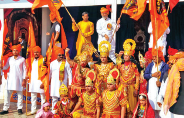
Shree Ram Leela Club Sainik Colony taking out Shobha Yatra.