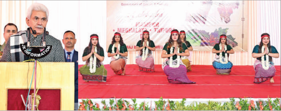
Lieutenant Governor Manoj Sinha witnessing cultural event to celebrate the Tripura, Meghalaya and Manipur Statehood Day.

■ STATE TIMES NEWS JAMMU: Jammu Kashmir Raj Bhawan on Sunday organized a mega cultural event to celebrate the Tripura, Meghalaya and Manipur Statehood Day. Security personnel, students and the people of the Tripura, Meghalaya and Manipur living in J&K UT were the special invitees. On the occasion, Lieutenant Governor Manoj Sinha extended his greetings and best wishes to the people of Tripura, Meghalaya and Manipur on their Statehood Day.