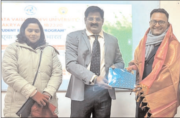
A dignitary being honoured at SMVDU.

■ STATE TIMES NEWS KATRA: As part of the Ek Bharat Shreshtha Bharat (EBSB) initiative, Shri Mata Vaishno Devi University Katra is hosting students from the Academy of Maritime Education and Training (AMET) Chennai, Tamil Nadu who are participating in the student exchange program under Azadi Ka Amrit Mahotsav(AKAM) from 21st January to 26th January 2024. For their stay, the university has organized visits to royal mahals, museums, and temples that apprise the historic culture of the Union territory of Jammu and Kashmir. They will also hear the stories of the mountains