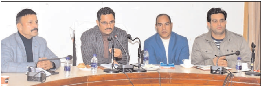
DC Rajouri, Om Prakash Bhagat chairing interactive session with local media persons.

■ STATE TIMES NEWS RAJOURI: To foster corporation with the media, Deputy Commissioner Rajouri, Om Prakash Bhagat on Monday chaired an interactive session with the local media persons. During the engaging discussion, media persons commended the District Administration for its proactive measures to address public grievances and enhance the overall development of the district. The discussion focused on the crucial role played by media persons in generating widespread awareness about online services and the national campaign for a "Nasha Mukht Bharat" (Addiction-free India). During the session, the Deputy Commissioner Om Prakash Bhagat emphasized the importance of media cooperation in highlighting people's concerns and