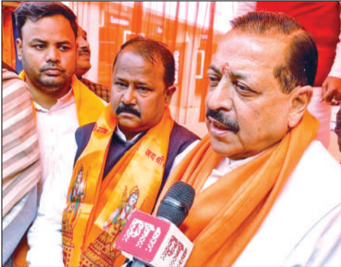
Union Minister Dr. Jitendra Singh speaking to the media during an event to celebrate Ram Mandir "Pran Pratishtha" ceremony, at New Delhi on Monday.

Dr Jitendra said, Prime Minister Narendra Modi's nine plus years in office will be remembered for many