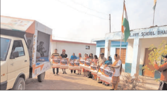
People participating in Viksit Bharat Sankalp Yatra at Rajouri.

Central to this endeavor is an Information, Education, and Communication (IEC) van, a dynamic mobile platform designed to effectively communicate and create awareness about the diverse initiatives undertaken as part of the Yatra. The van plays a pivotal role in engaging with local communities, imparting crucial knowledge, and empowering residents to avail themselves of the bene-