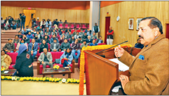
Union Minister Dr. Jitendra Singh, as chief guest, addressing the Vaishvik Bharatiya Vaigyanik (VAIBHAV) Fellowship event, at New Delhi, on Tuesday.

Dr Jitendra emphasized that our Indian diaspora in Science, Technology,