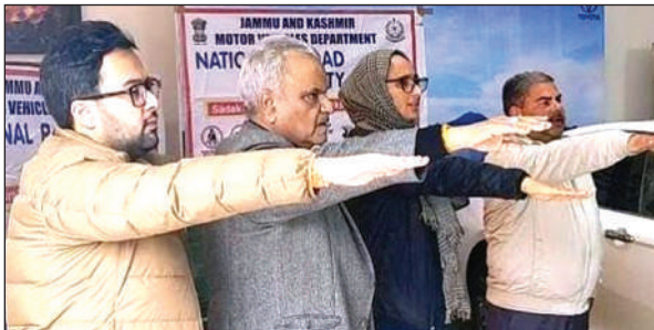
MVD officials and others taking pledge.