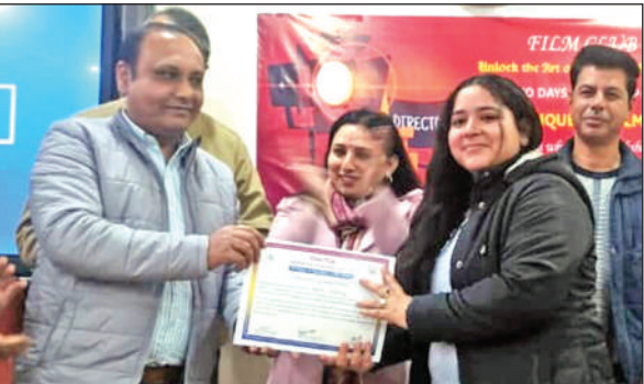
Coordinator of Film Club, JU presenting certificate to a participant.