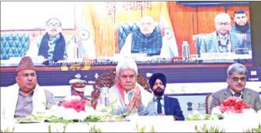
Home Minister Amit Shah launching e-bus service in Jammu and distributing appointment letters for Jammu & Kashmir Combined Examination and compassionate appointment through video conference. LG Manoj Sinha also participating in the event.

■ STATE TIMES NEWS JAMMU: Jammu and Kashmir did not witness a single incident of stone pelting in 2023 while there was a 66 per cent decline in terrorist incidents and an 81 per cent drop in civilian killings since the scrapping of Article 370, Union Home Minister Amit Shah said on Thursday. Launching an e-bus service in Jammu through video conferencing from New