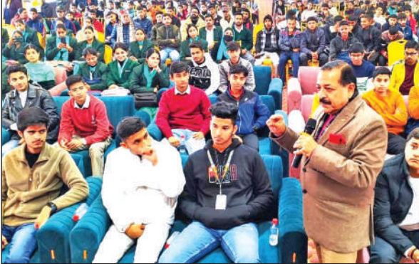
Union Minister Dr. Jitendra Singh interacting with first time voters during "Nav Matadata Sammelan" by BJYM to mark "National Voters Day", at Udhampur on Thursday.

After the arrival of Prime Minister Narendra Modi at the national stage, all that has changed due to the