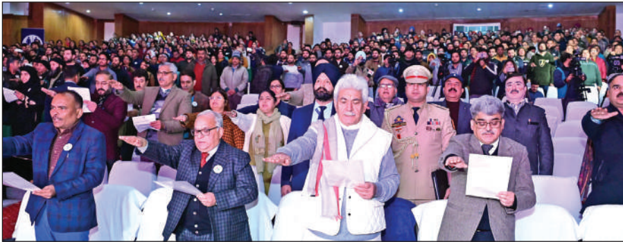
Lt Governor Manoj Sinha administering the National Voters' Day pledge to officials.

"This year's theme of National Voters' Day - 'Nothing Like Voting, I Vote For Sure' re-affirms the ideals of the founding fathers of the Constitution and power of the people in decision-making and shaping their own destiny," the