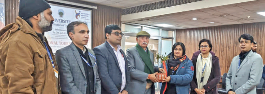
Dignitaries and faculty of CUJ during a programme.