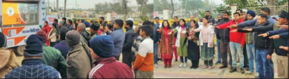
Viksit Bharat Sankalp Yatra-celebration of development and empowerment advances across Samba District.