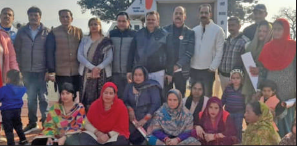
Viksit Bharat Sankalp Yatra leaves lasting impact in Udhampur District Panchayats.