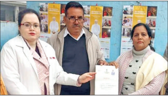
Viksit Bharat Sankalp Yatra captivates Chack Gadha Dhar, Badala and Chack Desa Singh Panchayats in Block Kathua.