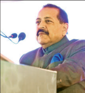
Union Minister Dr. Jitendra Singh speaking after inauguration of Mega Expo "Emerging StartUp Trends in North India" by Vice President of India, Jagdeep Thakkar, at Biotech Industrial Park, Kathua.

Dr Singh informed that India's BioEconomy has experienced a remarkable surge of 29 percent, surpassing the significant milestone of $100 billion. The BioEconomy has reached an impressive $137.2 billion in 2022. Each month, India's BioEconomy has contributed $11.4 billion to the national GDP, Dr Singh added. He