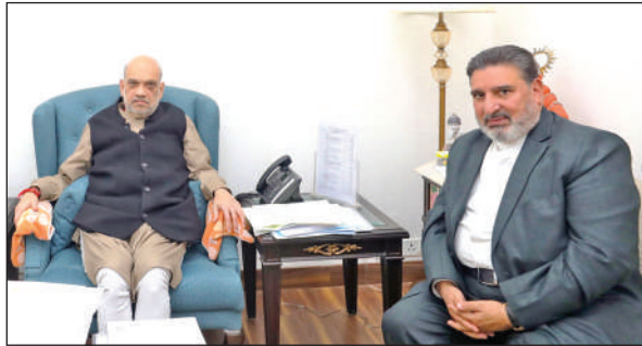
JKAP President, Mohammad Altaf Bukhari calling on Union Home Minister Amir Shah in New Delhi.

that while dealing with militancy and terrorism, security agencies must ensure that no civilian deaths or human rights violations occur. Civilian killings cannot and should not be tolerated, he added.