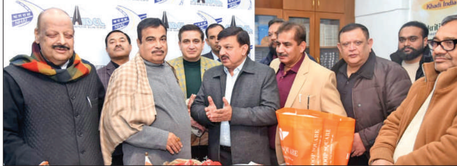
CCI Jammu delegation calling on Nitin Gadkari, Union Minister of Road, Transport and Highways at New Delhi.

concerns and recommendations regarding the ongoing infrastructure development projects in the Union Territory of Jammu and Kashmir; particularly the Katra Delhi Expressway. Arun Gupta drew the attention of the Minister to the proposed construction design of the expressway flyover between Kunjwani to Narwal, which includes the implementation of blind walls. While we acknowledge the importance of infrastructure development, we are concerned that the blind walls on both sides of the expressway may disrupt vital connections between shops, businesses, and residences.