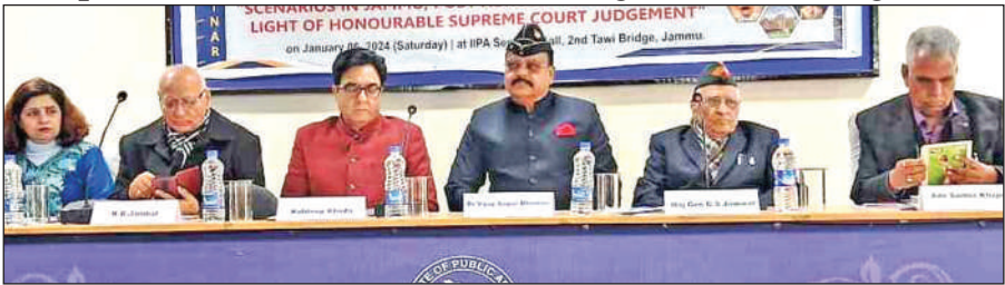
Dignitaries at seminar being organized by IIJSA in Jammu on Saturday.