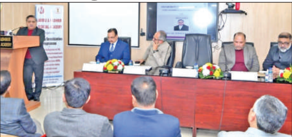
A dignitary speaking at JKJA's sensitization programme at Jammu.

■ STATE TIMES NEWS JAMMU: Jammu and Kashmir Judicial Academy (JKJA) on Saturday organised a day-long sensitization programme for Registrars and Sub-Registrars of Jammu Province in collaboration with the J&K Registration Department at Judicial Academy, Janipur here. The programme was organised with an aim to hone the skills and knowledge of officers and increase their efficiency in discharging their statutory duties more efficiently.