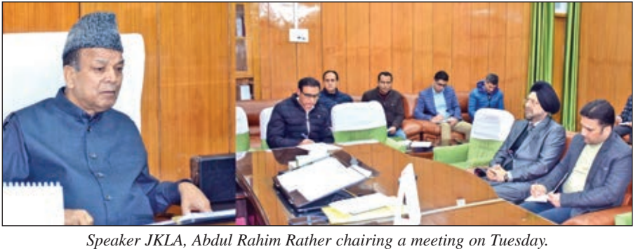
Speaker JKLA, Abdul Rahim Rather chairing a meeting on Tuesday.

STATE TIMES NEWS JAMMU: Speaker, Jammu and Kashmir, Jammu and Kashmir Legislative Assembly (JKLA), Abdul Rahim Rather on Tuesday convened a meeting with senior officers of Information, floriculture and State Motor Garage Departments to review and finalize the necessary arrangements for smooth conducting of three days training programme for newly elected MLAs of Union Territory of Jammu and Kashmir. The orientation program will be held from 9th to 11th January, 2025 at Central Hall of J&K Legislative Assembly Jammu in collaboration with the Parliamentary Research and Training Institute for Democracies (PRIDE), Lok Sabha Secretariat, New Delhi.