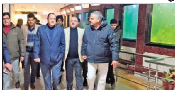
Agriculture Minister, Javed Ahmad Dar visiting Bahu Fort Aquarium Cum Oceanarium on Tuesday.

STATE TIMES NEWS JAMMU: Minister for Agriculture Production, Rural Development and Panchayati Raj, Javed Ahmad Dar on Tuesday remarked that Bahu Fort Aquarium Cum Oceanarium will become prime tourist attraction in Jammu region in coming days.