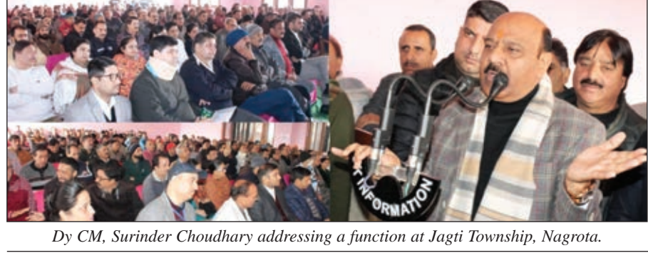
Dy CM, Surinder Choudhary addressing a function at Jagti Township, Nagrota.

STATE TIMES NEWS JAMMU: Deputy Chief Minister, Surinder Choudhary on Tuesday reaffirmed that Kashmiri Pandits (KPs) are an integral part of the cultural and social fabric of Jammu and Kashmir and government is committed towards their dignified rehabilitation. The Deputy CM made these remarks while addressing a function on the side lines of his visit to Jagti Township, Nagrota here today. The Deputy CM was accompanied by Relief Commissioner (Migrants), Director Health Services Jammu, Director General Floriculture, Director Food supplies Jammu, and other senior officers. On the occasion, Surinder Choudhary reiterated the government's dedication to addressing the concerns of Kashmiri Pandits and ensuring their well-being through targeted initiatives, robust support system and various welfare schemes.