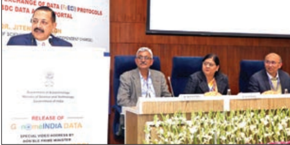
Union Minister Dr. Jitendra Singh addressing the "Genome India Data Conclave" at Vigyan Bhawan, New Delhi.

The Minister also launched 'Framework for Exchange of Data Protocols (FeED) and Indian Biological Data Centre (IBDC) Portals for Data Access at 'Genome India Data' Conclave today at Vigyan Bhawan here. On the occasion, Prime Minister Narendra Sh Narendra Modi's Video Message motivated the scientific fraternity and also laid a roadmap for the future. The Department of Biotechnology (DBT) has implemented the flagship project, 'GenomeIndia', for whole genome sequencing (WGS) of 10,000 individuals representing various Indian populations. This project