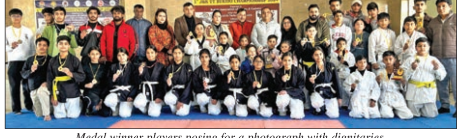
Medal winner players posing for a photograph with dignitaries.

STATE TIMES NEWS JAMMU: The Bukido Association of J&K successfully organized the 1st J&K UT Bukido Championship which held at Kotli Bhawan Hall, Rehari, here. The event witnessed enthusiastic participation from more than 130 athletes representing five districts of the UT, highlighting their skills and passion for martial art.