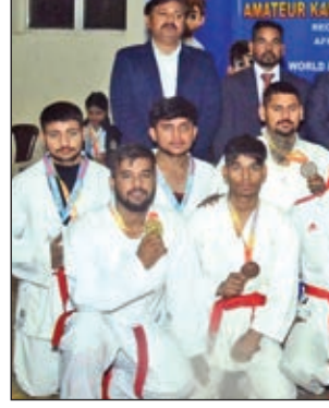
Winner players posing for a photograph with dignitaries.

STATE TIMES NEWS JAMMU: The Kumite trophy bagged by Amateur Karate Association J&K (AKAJK) in the two-day XI J&K UT Karate Championship which held for different age groups at Indoor Stadium, Bhagwati Nagar, here on Tuesday. Second place went to Jammu District while Baramulla and Udhampur District finished joint third. The championship was organized by Amateur Karate Do Association of Jammu and Kashmir, a recognized unit of the J&K State Sports Council. More than 500 participants from different districts including Jammu, Rajouri, Kathua, Reasi, Srinagar, Ganderbal,