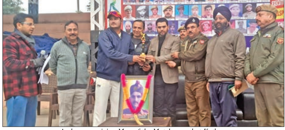
A player receiving Man of the Match award at Kathua.