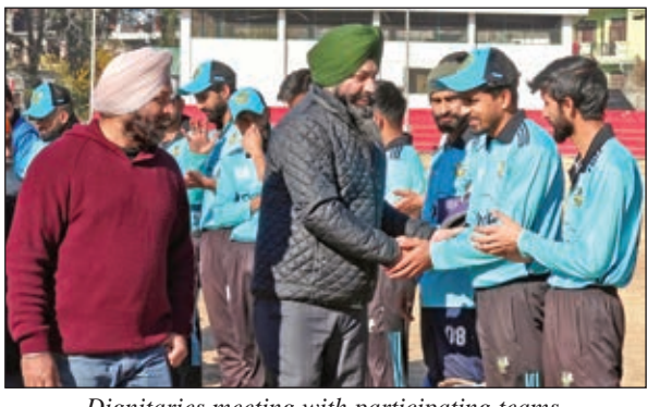
Dignitaries meeting with participating teams.