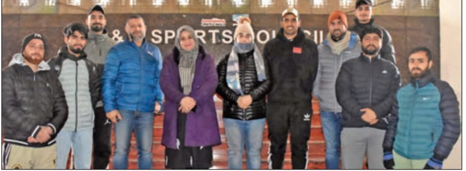
Selected team posing for a photograph with dignitaries.