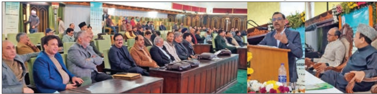
MP Lok Sabha, N K Premachandran and others addressing orientation programme for MLAs in Jammu.