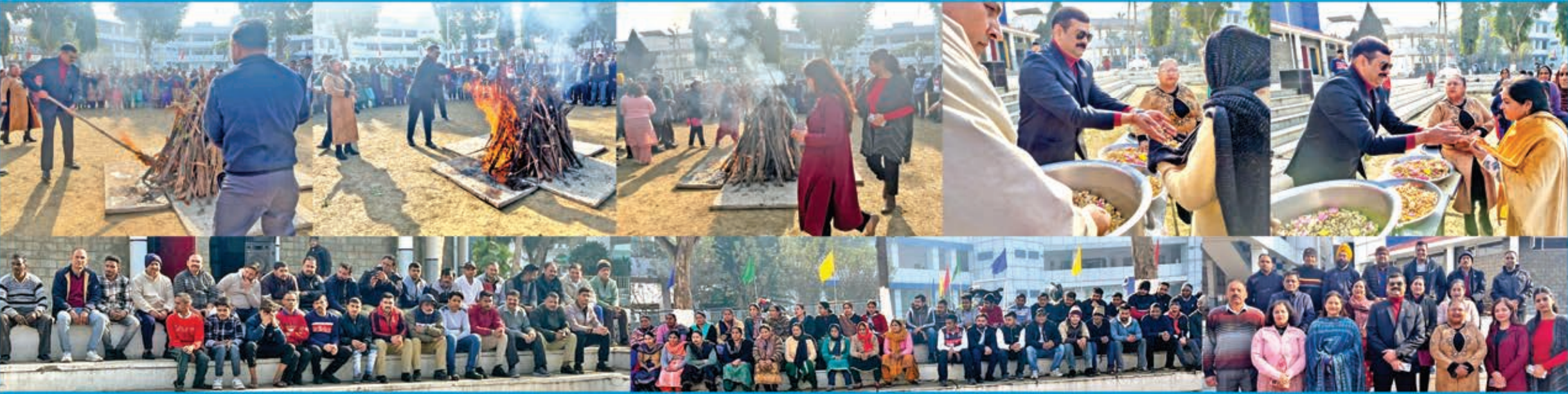
Glimpses of Lohri celebration at JK Public School Kunjwani on Monday.