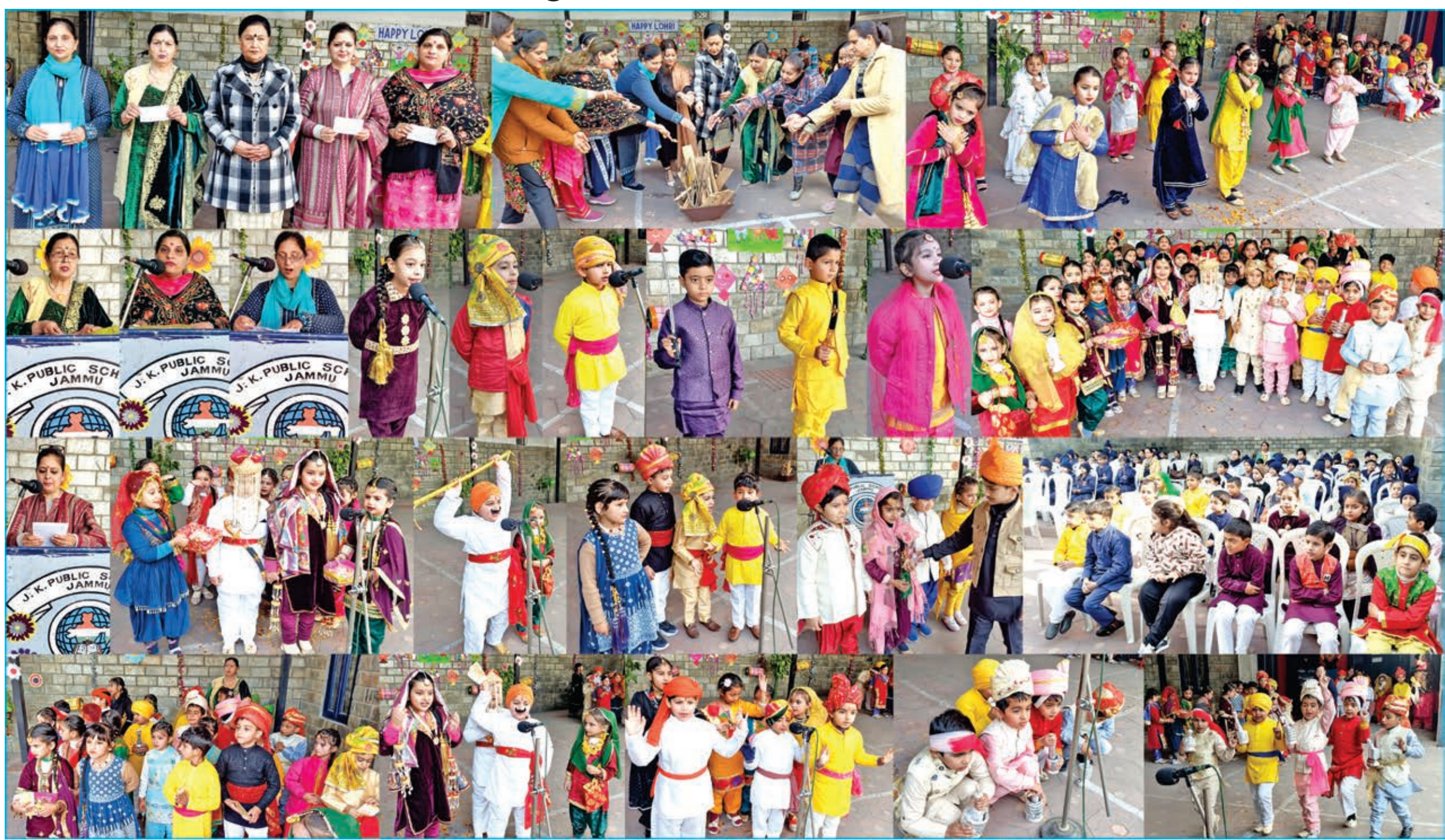
Glimpses of Lohri celebration at JK Public School Panjtirthi.