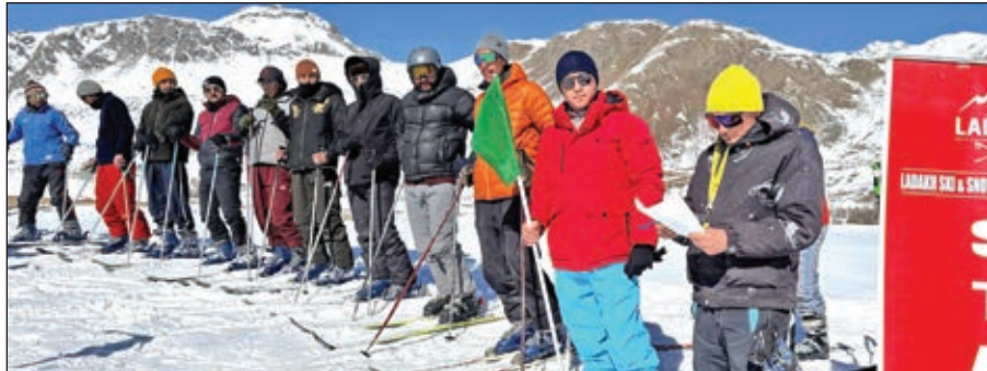
Participants at a selection trials for Winter Games.