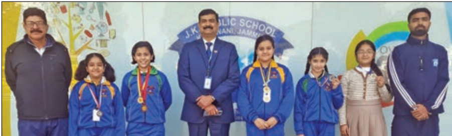
JK Public School Kunjwani faculty felicitating winner students.