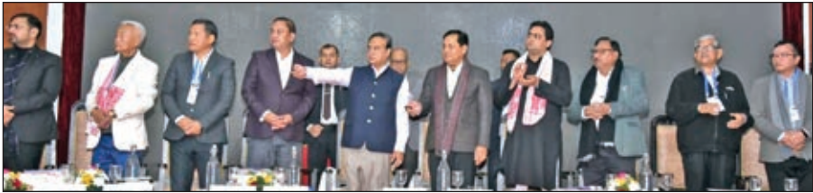
Union Minister of Ports, Shipping & Waterways, Sarbananda Sonowal and others at meeting of IWDC.

The meet also witnessed ministerial participation from the Union Minister of State for MoPSW, Shantanu Thakur; the Ports Minister of Goa,