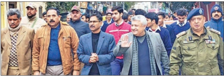
Transport Commissioner J&K Vishesh Paul Mahajan leading road safety rally.