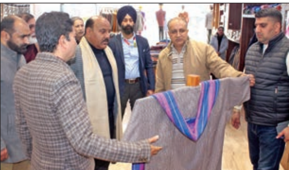
Dy CM, Surinder Kumar Choudhary interacting with officers during visit to JKI showroom.

■ STATE TIMES NEWS JAMMU: Deputy Chief Minister, Surinder Kumar Choudhary, on Thursday said that the local industry plays a pivotal role in employment generation besides helping in boosting the economy of a particular region. "The role of local industrial sector is of significant importance in ensuring that the economy of a particular area gets the necessary boost and the present government is committed to ensure its proper growth by way of various interventions and industry friendly schemes" the Deputy Chief Minister maintained. The Deputy Chief Minister was interacting with the officers during his visit to Jammu