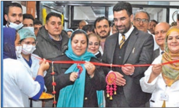
Health Minister Sakeena Itoo inaugurating ICU.

■ STATE TIMES NEWS JAMMU: Minister for Health and Medical Education, Social Welfare and Education, Sakeena Itoo, on Thursday conducted an extensive inspection of Government Medical College (GMC) and Super Speciality Hospital (SSH) Jammu to assess the medical facilities, evaluate ongoing works and ensure effective functioning of healthcare services for the people of Jammu and surrounding regions.