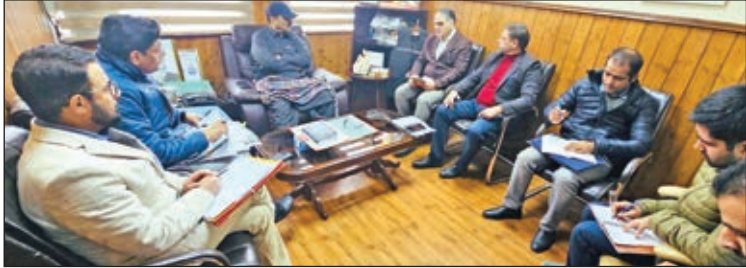
Minister for Tribal Affairs, Javed Ahmad Rana chairing a meeting.

During the discussion, the Minister directed the officials to expedite approvals for pending proposals under the Dharti Aaba scheme, which focuses on sustainable agriculture and economic empowerment in tribal areas. He set specific timelines to ensure that