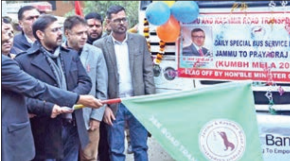
Minister for Transport, Satish Sharma flagging off bus service from Jammu to Prayagraj.

take the passengers back after a night halt.