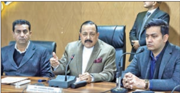
Union Minister Dr. Jitendra Singh speaking during the Swamitva programme at Kathua on Saturday.

Distributing SVAMITVA Property Cards to the local beneficiaries at DC Office Kathua. The event was organized as part of the nationwide initiative to distribute SVAMITVA (Survey of Villages Abadi and Mapping with Improvised