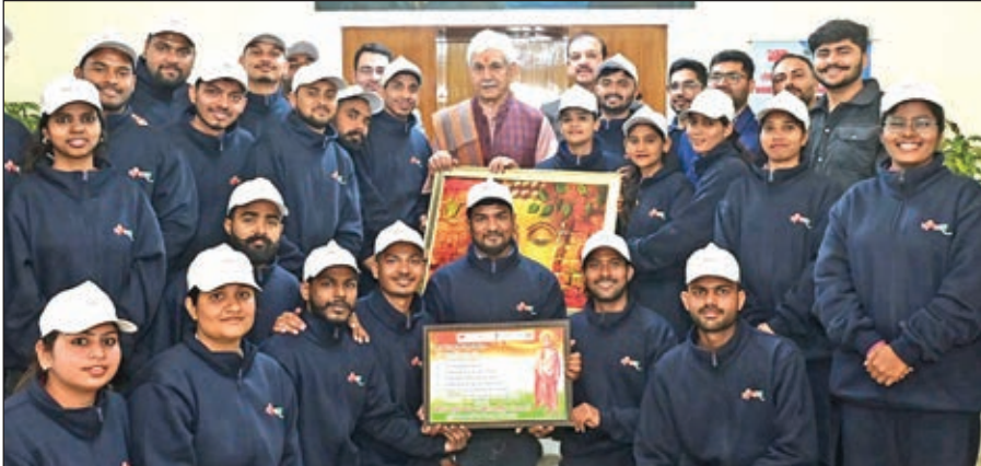
Lieutenant Governor Manoj Sinha interacting with the youth participating in Border Area Youth Exchange Programme.

■ STATE TIMES NEWS JAMMU: Lieutenant Governor Manoj Sinha on Sunday interacted with the youth from Uttar Pradesh, Delhi, Haryana, Rajasthan and Madhya Pradesh, who are on a five-day visit to Jammu under Border Area Youth Exchange Programme (BAYEP), under the aegis of NYKS-MY Bharat, Ministry of Youth Affairs and Sports,