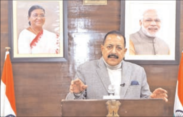
Union Minister Dr. Jitendra Singh speaking after inaugurating India's first-of-its-kind CSIR "Innovation Complex" at Mumbai.

■ STATE TIMES NEWS NEW DELHI : Union Minister, Dr. Jitendra Singh inaugurated India's first-of-its-kind CSIR Mega "Innovation Complex" at Mumbai and dedicated it to StartUps and Industry stakeholders. The new Innovation Complex at Mumbai, inaugurated by the Science & Technology Minister, is a huge state-of-the-art set up spread over nine floors, equipped with 24 "ready-to-move" incubation labs in addition to furnished office and networking spaces for innovative StartUps, MSMEs, industry, and CSIR labs. The Mega facility will provide high-end scientific infrastructure, expertise, and regulatory support to stakeholders including CSIR labs, StartUps, MSMEs, and industry, for the SOP-driven studies necessary for regulatory submissions and compliance. The Complex includes ready-to-move world-class incubation labs and IP/business development support for innovative start-ups, companies partnering with CSIR labs, MSMEs, deep-tech companies from India and abroad, public-funded research institutions, and CSIR labs." Catching up with the excitement of the audience, Dr. Jitendra Singh remarked, "This inauguration is just the beginning. We are excited about