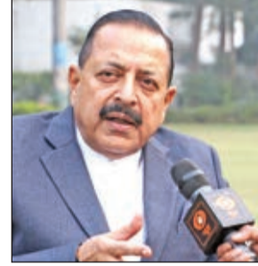
Union Minister Dr. Jitendra Singh in an exclusive New Year interview to DD News at New Delhi.

Reflecting on the past decade of progress under the leadership of Prime Minister Narendra Modi, Dr. Jitendra Singh emphasized the pivotal role of biotechnology in India's future, particularly as the country continues to embrace innovation, technology-based interventions, and startups. "Prime Minister Modi's vision has consistently prioritized innovation and technological advancement, driving India's evolution into a global biotechnology powerhouse," said Dr. Singh. He added that biotechnology is poised to be at the forefront of the Fourth