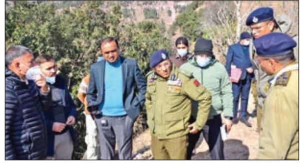
Divisional Commissioner Jammu, Ramesh Kumar and ADGP Jammu Anand Jain assessing situation at Badhaal village.

Designated officers are tasked with maintaining a log book with three daily entries documenting food distribution and consumption to safeguard public health and contain the spread of the situation.