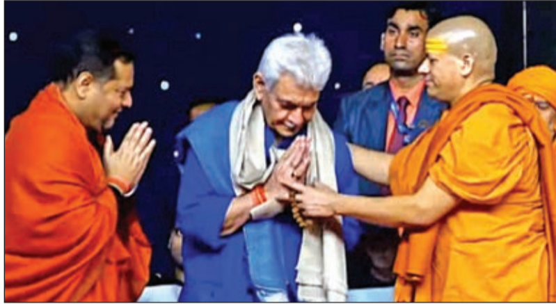
LG Manoj Sinha being honoured at Shrimad Bhagwat Samagam at Mahakumbh on Wednesday.

"Samagam is the door to enter the highest level of consciousness. This is also a confluence of great personalities who provide leadership to various sectors of society," the Lieutenant Governor said. He asked the religious heads, saints,