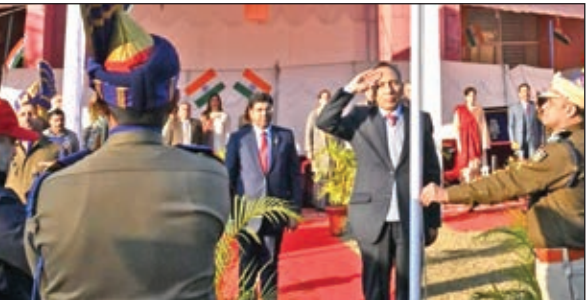
Chief Justice, Tashi Rabstan hoisting the National Flag at High Court Wing Jammu on R-Day.

JAMMU: The High Court of Jammu & Kashmir and Ladakh on Sunday celebrated the 76th Republic Day with main function held in the High Court Wing Jammu wherein Chief Justice, Tashi Rabstan, hoisted the National Flag.