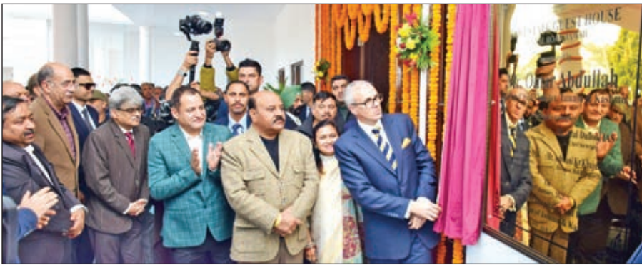
CM Omar Abdullah inaugurated Tawi State Guest House on Canal Road, Jammu.