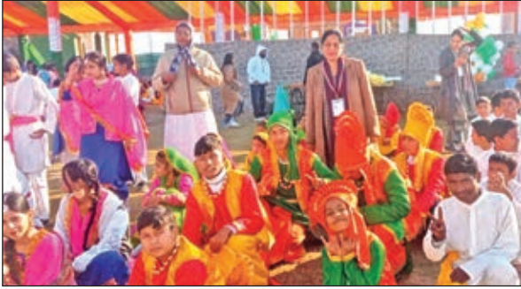
Hearing-impaired students from the Samaj Kalyan Kendra participating in R-day celebration at MA Stadium.

Thanks to the efforts of the Republic Day Committee and the Chief Education Officer of Jammu, these talented individuals from the School for Hearing