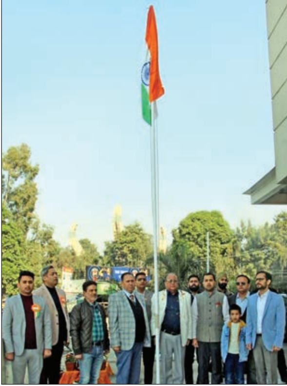
JNE Guild members hoisting National Flag on Republic Day at Jammu.