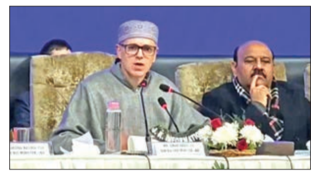
CM Omar Abdullah addressing press conference at Srinagar.

STATE TIMES NEWS SRINAGAR: Asserting that the Centre should be given "first chance" to fulfil its promise of restoring the statehood to Jammu and Kashmir, Chief Minister Omar Abdullah on Thursday said approaching courts on the issue would mean a "fight" and that it should be the "last option". During his first media meet here since assuming office in October, Abdullah also dismissed suggestions that his National Conference was under pressure to join the BJP-led NDA and expressed optimism that the promises made by the Centre to restore statehood of Jammu and Kashmir will be fulfilled at the earliest. When asked why the J-K government did not approach court for restoration of statehood and went to the Centre with the resolution on it, he said going to the courts would mean getting into