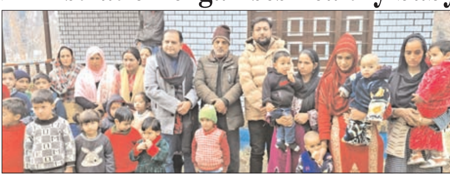
Officials along with women and their children.

The event will begin at the Panchayat level, proceed to the Block level, and culminate at the District level in both categories male and female in the age group of 6 months to 6