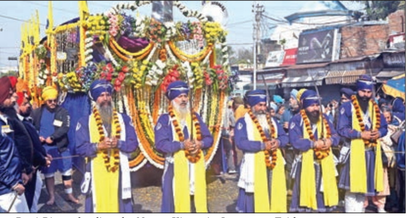
Panj Piyare leading the Nagar Kirtan in Jammu on Friday. (More pics on Pg-5)

Holy Guru Granth Sahib was placed. The vehicle/chariot was decorated with flowers and buntings and fitted with loud speakers. Besides head priest, several other Sikh religious personalities