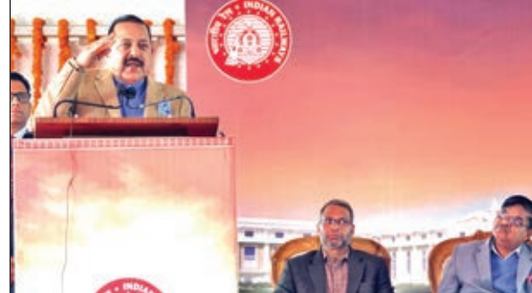
Union Minister Dr. Jitendra Singh speaking during virtual inauguration of New Jammu Railway Division by PM Narendra Modi, at Jammu Railway Station on Monday.

JAMMU: A new chapter was etched in the history of Jammu and Kashmir and Indian Railways today as Prime Minister Narendra Modi inaugurated the New Jammu Railway Division virtually.