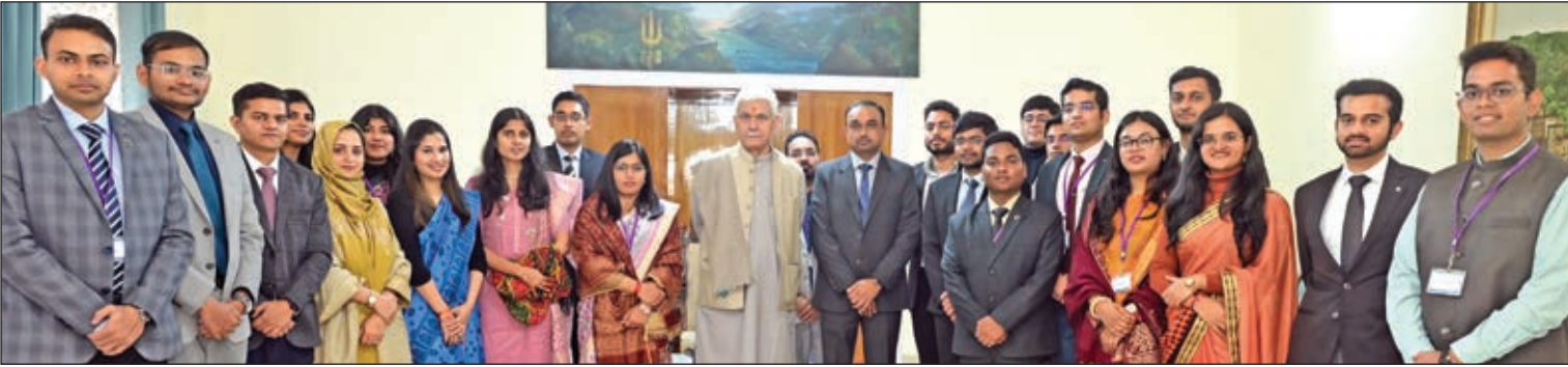
Lieutenant Governor Manoj Sinha along with IAS Officer trainees of the 2024 batch at Raj Bhawan on Monday.