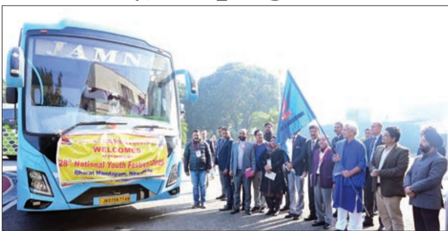
LG Manoj Sinha flagging off J&K UT Contingent for National Youth Festival from Jammu on Wednesday.

STATE TIMES NEWS JAMMU: Lieutenant Governor Manoj Sinha on Wednesday said that youth are responsible for writing their own destiny and shaping the future of Jammu Kashmir.