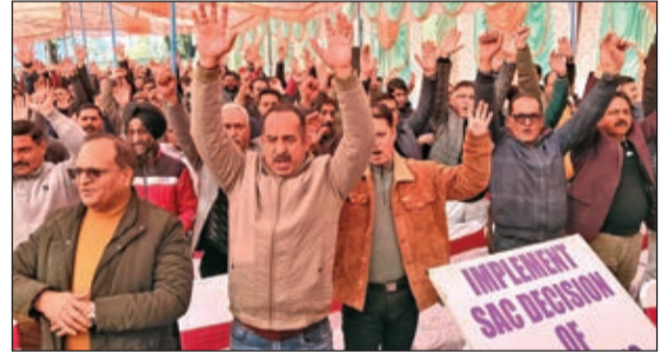
PDD engineers raising slogans during a protest.

Despite multiple review meetings chaired by the Chief Secretary, no progress has been made on regularizing 250