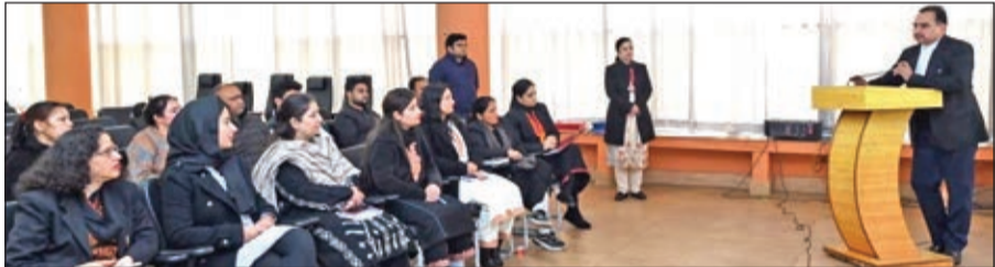
A resource person speaking in the training programme.

The resource person of the training programme was