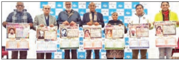
Dogri Sanstha Jammu members releasing Dogri calendar for 2025.

He further added that the special feature of Dogri Calendar is that it carries the exclusive information about festivals of Duggar Pradesh and helps us, the Dogras to