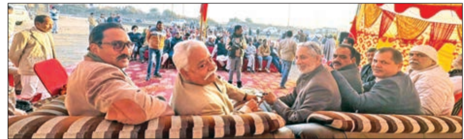
National Conference Additional General Secretary and other leaders in public meeting at Bhagwati Nagar W. No. 32 of Jammu Municipal Corporation.